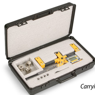
Carrying case included

Common calibration period is 24 months but should be more frequent in heavy use applications. Factory calibrations typically completed in 2 to 4 days. On site calibration may be possible through your Dillon distributor.