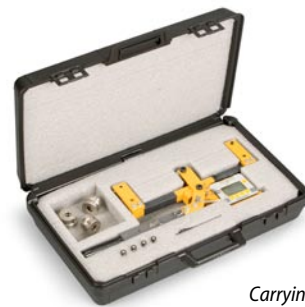
Carrying case available.

Dillon also manufactures highly accurate tensiometers, mechanical dynamometers and crane scales.